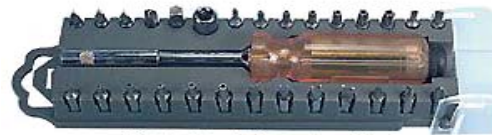
30-piece Security Screwdriver Set

There are two different screwdriver sets included with the Forensic Solid Steel Tower - Dual Opteron system: the 30-piece Security screwdriver set and the Craftsman 10-in-1 Screwdriver. The 30-piece Security Screwdriver set comes with 30 different security bits for items such as: IBM PS/2 monitors, CATV and telephone equipment, and many ottV and telephone equipment, and many other Tools Bit Sets Pher items, and a screwdriver and a case to hold them in. There is a compartment in the handle of the screwdriver, in which one may store other bits. The Craftsman 10-in-1 screwdriver has four dual-headed bits in a “quick-change” bit system, in-shaft bit storage and a cushioned handle grip. One can use the Craftsman screwdriver as a Phillips (1 or 2), slotted (3/16 or 1/4 inch), Torx ® (10 or 15), square recess (1 or 2) and also as a nut driver (1/4 or 5/16 inch).